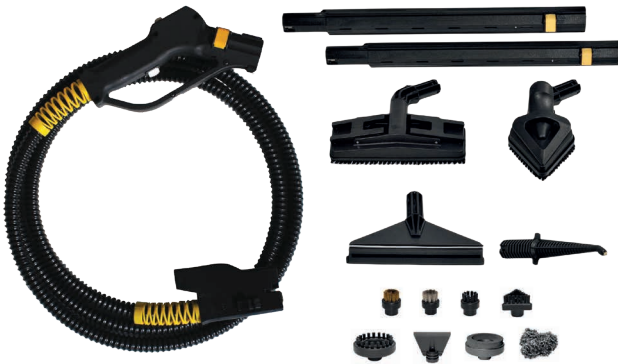
JULY 6 BAR Steam 165°C