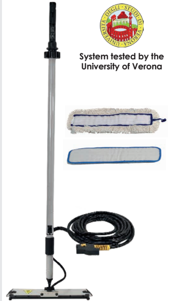
STEAM MOP Steam 165°C