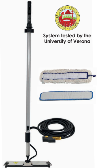
STEAM MOP Steam 165°C