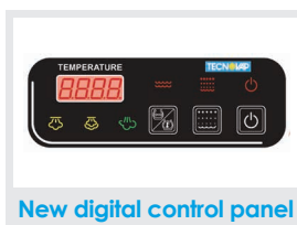
New digital control panel