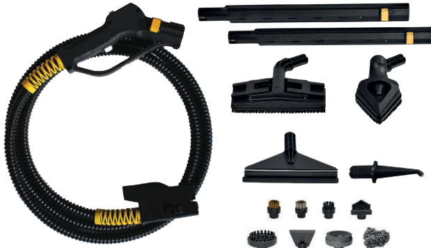
JULY 6 BAR Steam 165°C